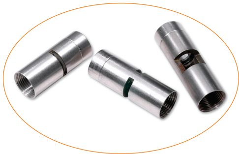
The stainless steel RT-series tips screw onto the end of the T300-RT or T200-RT.